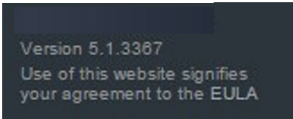
FIGURE 3 Current Cloudpath Version Lower Left